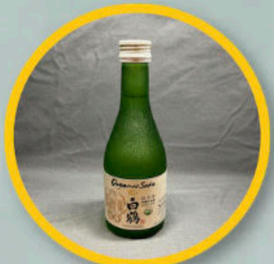
HAKUTSURU ORGANIC JUNMAI $18