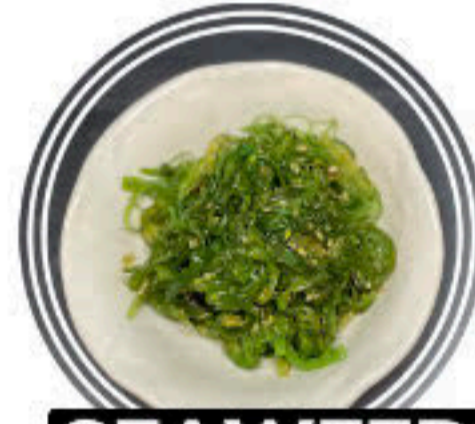
SEAWEED SALAD 7.00