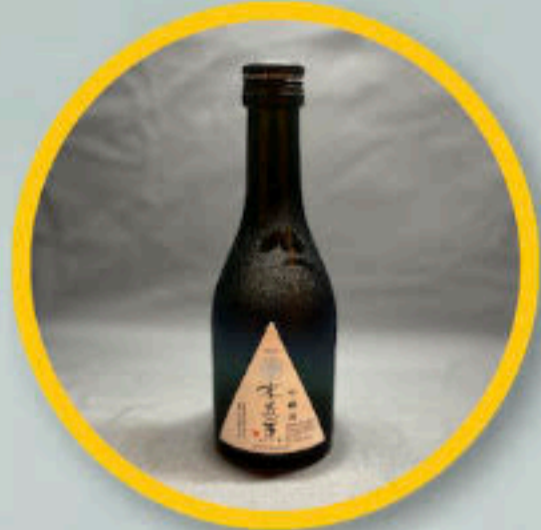
MIZUBASHO GINJO $24