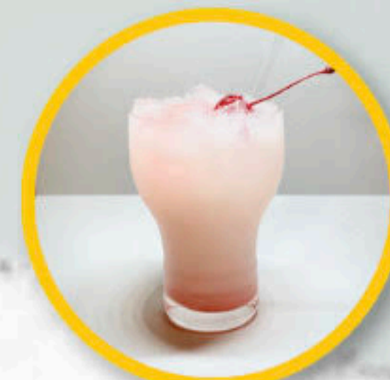
CALPICO SAKE $10