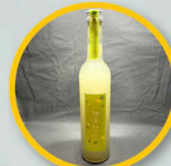
YUZU OMOI 3oz Glass $7.5 10oz Carafe $25 500ml Bottle $42.5