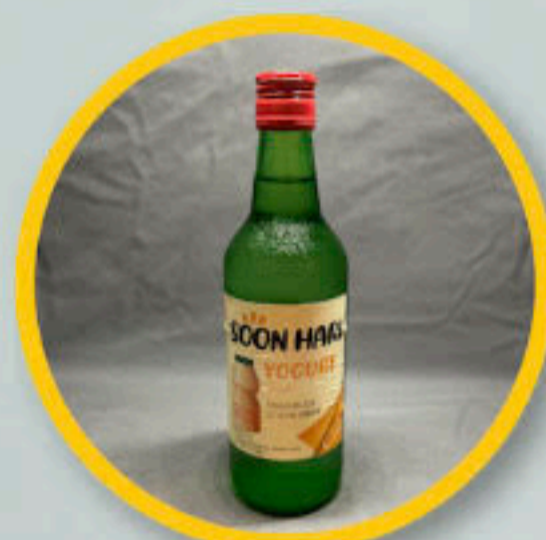
SOON HARI YOGURT $13