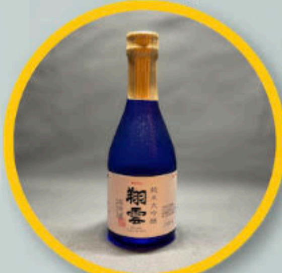
SHO-UNE JUNMAI DAIGINJO $27