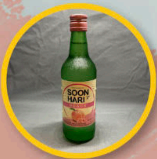
SOON HARI PEACH $13