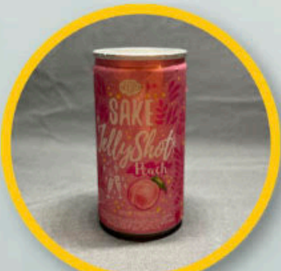
IKEZO JELLY SAKE PEACH $11