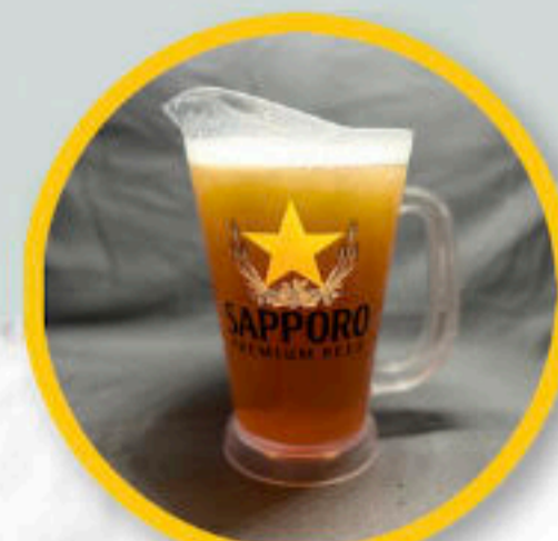
SAPPORO DRAFT PITCHER $23