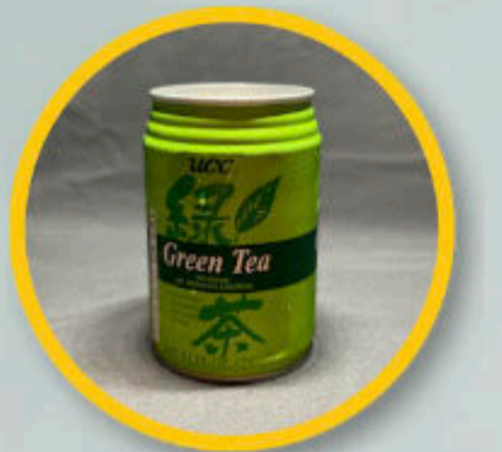
Ucc Green tea $4