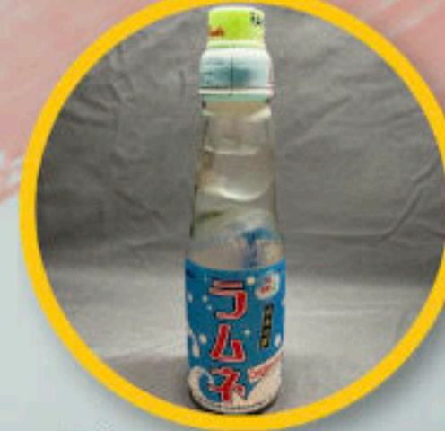
Ramune Original $5