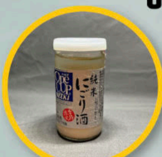
OZEKI ONE CUP NIGORI $10