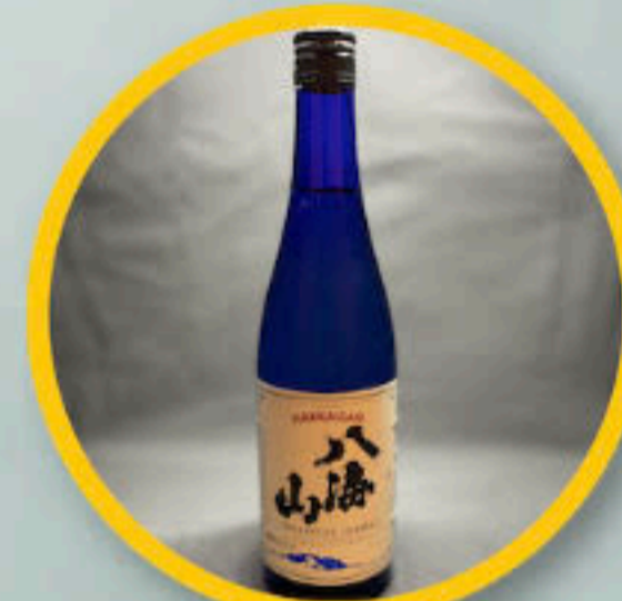
HAKKAISAN TOKUBETSU JUNMAI 3oz Glass $6 10oz Carafe $20 720ml Bottle $48