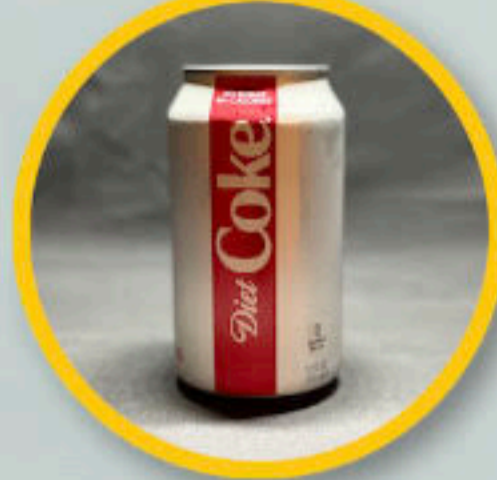
DIET COKE $2.5