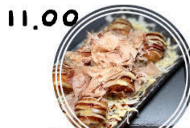
TAKO YAKI Octopus bread ball, bonito flake, Tako yaki sauce, mentaiko mayo