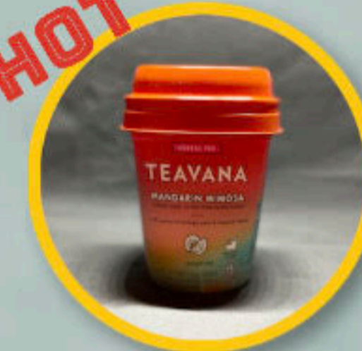
MANDARIN MIMOSA $3