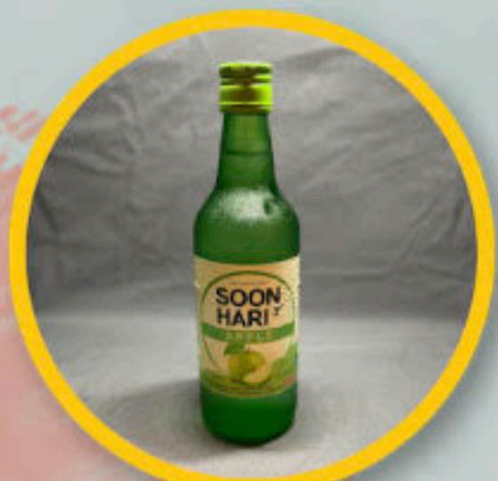
SOON HARI GREEN APPLE $13