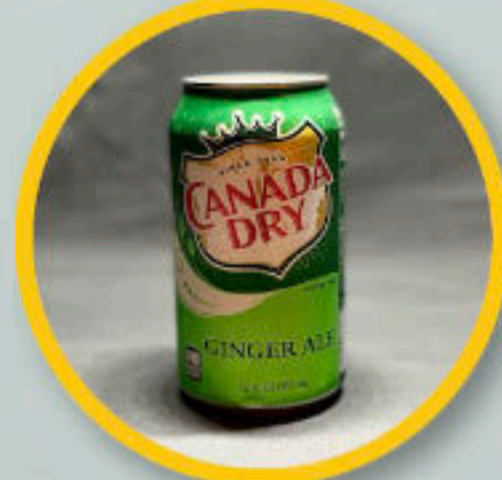
GINGER ALE $2.5