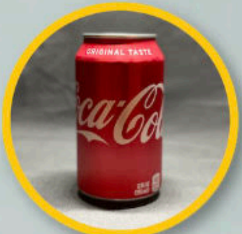
Coca cola $2.5