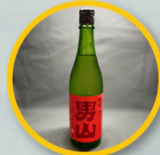
OTOKOYAMA CHOKARA JUNMAI 3oz Glass $6.5 10oz Carafe $21.5 720ml Bottle $52