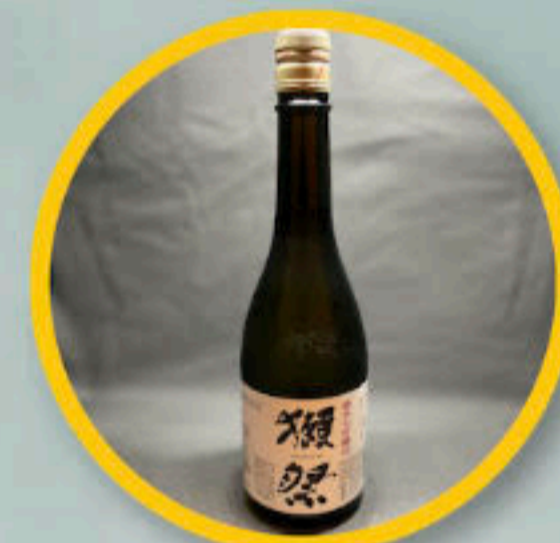
DASSAI 45 JUNMAI DAIGINJO 3oz Glass $6.5 10oz Carafe $21.5 720ml Bottle $52