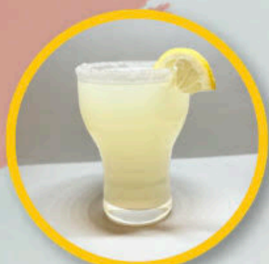
LEMON GINGER SAKE TINI $13