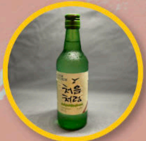
CHUM CHURUM ORIGINAL $13