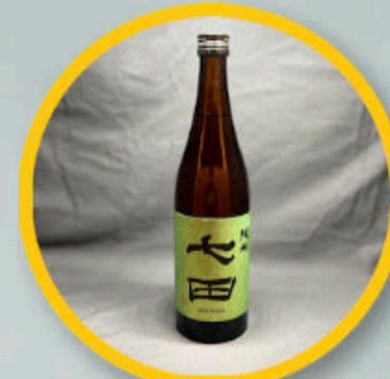
SHICHIDA JUNMAI 3oz Glass $7 10oz Carafe $23 720ml Bottle $56