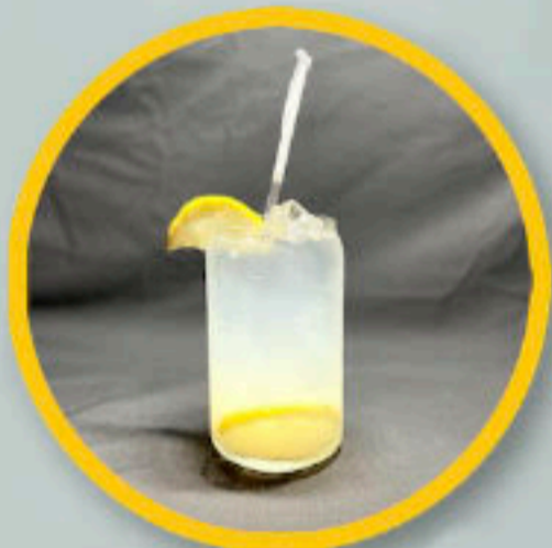
LEMON ADE $7