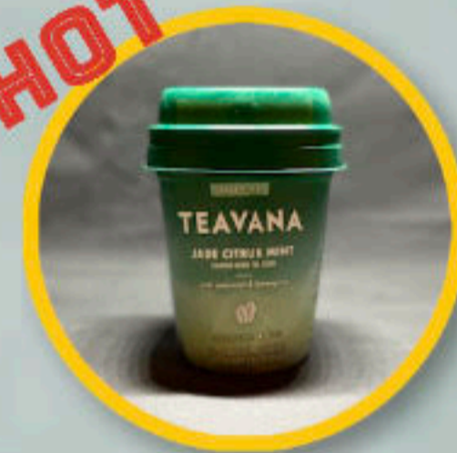
JADE CITRUS MINT $3