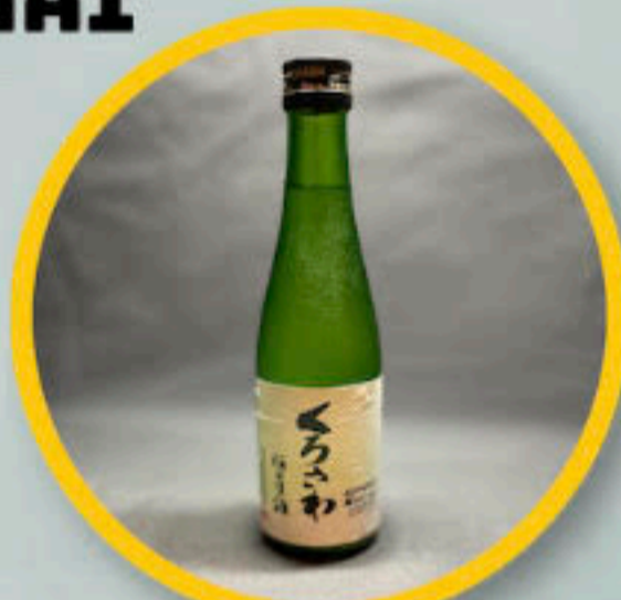
KUROSAWA NIGORI $24