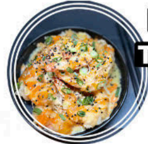
SHRIMP TEMPURA 13.50

Shoyu marinated fried chicken , spicy sambal mayo