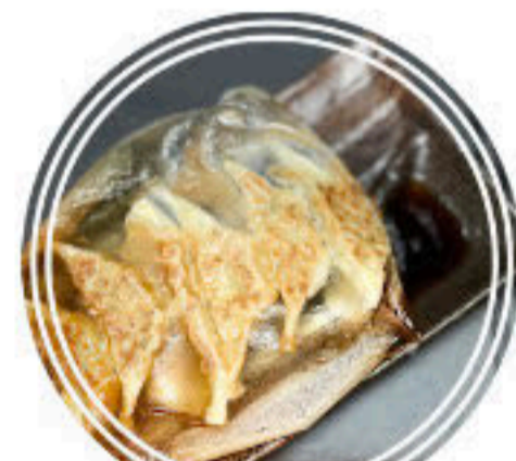
PAN FRIED GYOZA Pork & chive 9.00