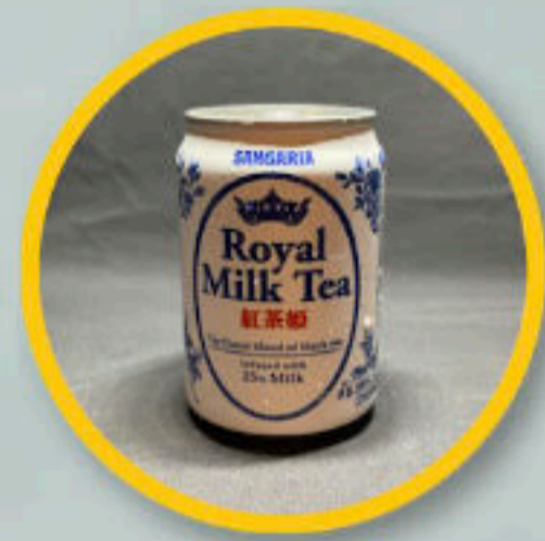
Royal milk tea $4.5