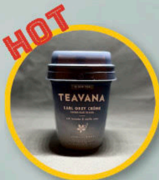
EAR GREY $3