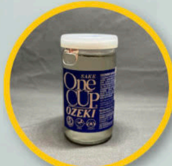
OZEKI ONE CUP JUNMAI $9