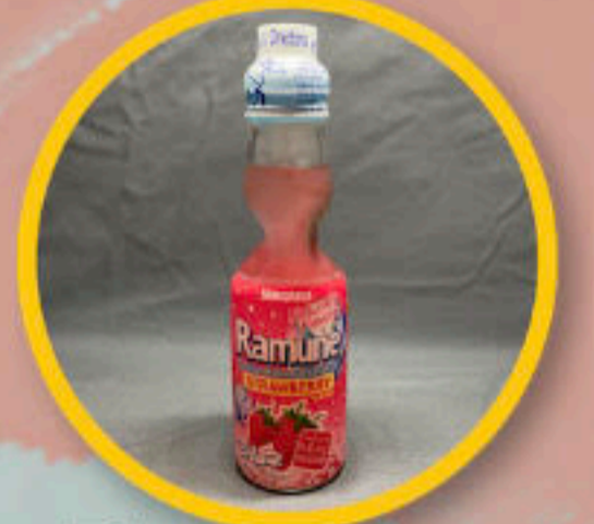
Ramune Strawberry $5