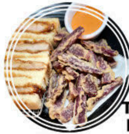
KATSU SANDO 4pc 12.00 With fries 15.00 Toasted Milk bread, Pork cutlet, Hatcho miso, Passion fruit jam

Fried shrimp, Cabbage salad, Mentaiko mayo