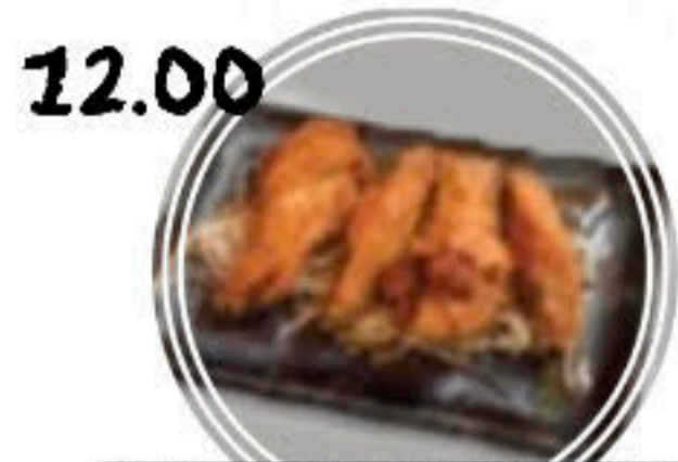
CHICKEN WING Soy glazed fried chicken wing