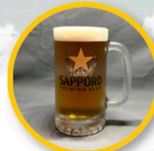
SAPPORO DRAFT GLASS $7