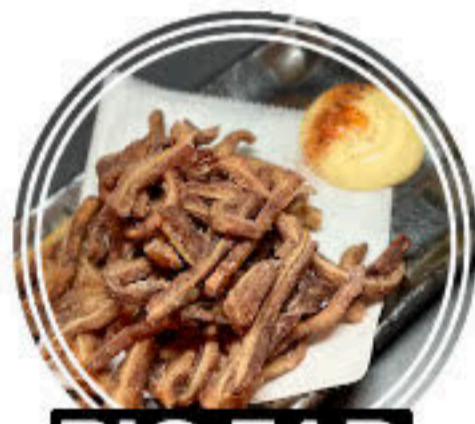
PIG EAR 10.00