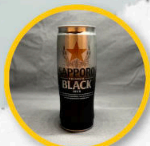
SAPPORO BLACK $9