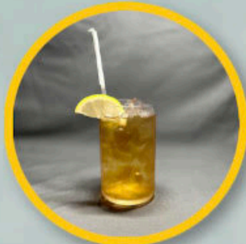
ICE TEA $6