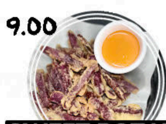
SWEET POTATO FRIES Purple sweet potato fries, Spicy sambal mayo