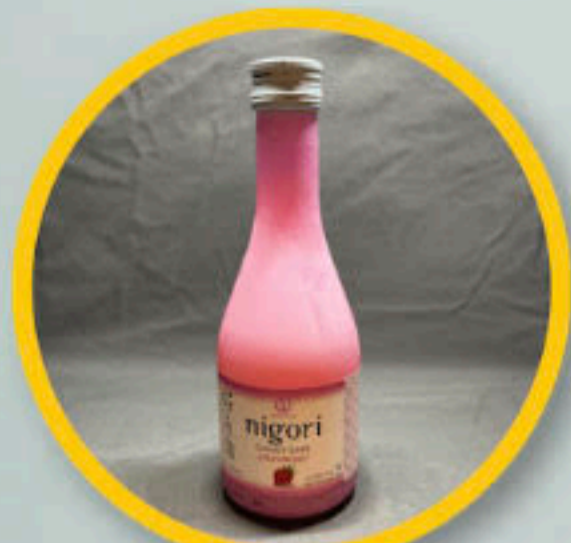
STRAWBERRY NIGORI $21