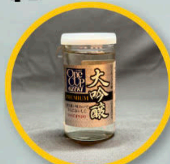
OZEKI ONE CUP DAIGINJO $11