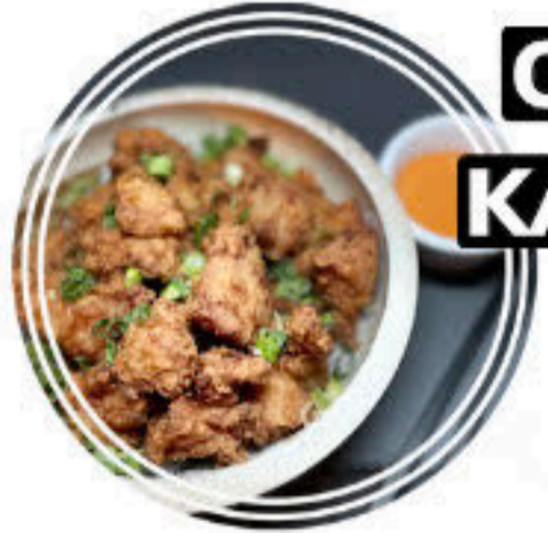
CHICKEN KARA-AGE 12.50

Shoyu marinated fried chicken , spicy sambal mayo