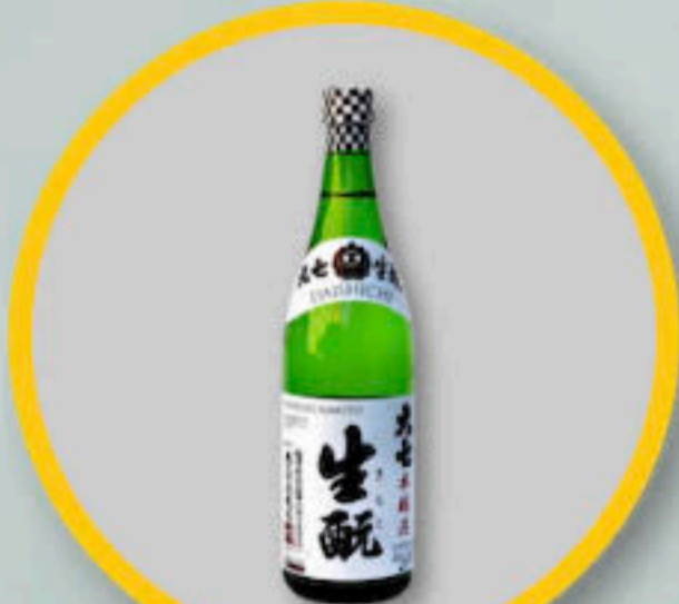
PREMIUM HOUSE SAKE HOT / COLD $11