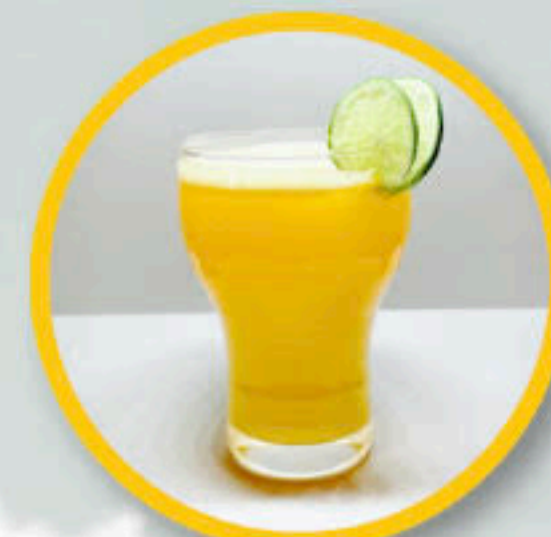
LYCHEE MANGO SAKE TINI $14