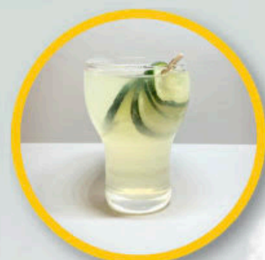
CUCUMBER SAKE TINI $12