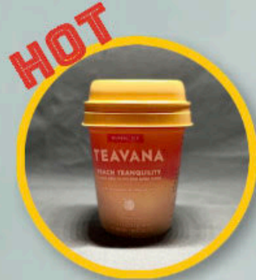
PEACH TRANQUILITY $3